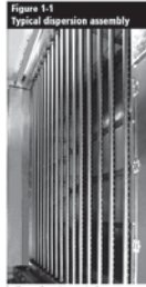
Shown here is a typical steam dispersion tube panel with insulated stainless steel tubes installed to span the full height and width of an air handling unit.

Direct steam injection humidification systems disperse steam into duct or AHU airstreams from on-site boilers or unified steam generators. Unique to direct steam injection applications is the dispersion of pressurized steam.