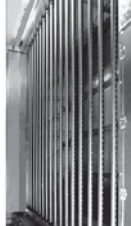
Figure 1-1 Typical dispersion assembly

Shown here is a typical steam dispersion tube panel with un-insulated stainless steel tubes installed to span the full height and width of an air handling unit.