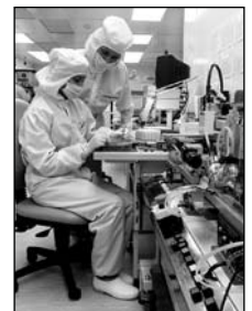
Operators in a clean room 2

Indoor RH control has become a critical need, and the number of commercial and industrial steam humidification systems in the world has never been higher.